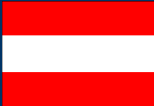
BAKIP Wiener Neustadt Österreich / Austria