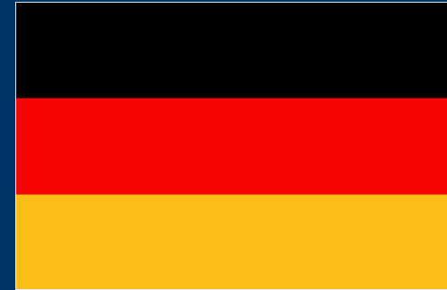
Kinderzentrum Thomizil Deutschland / Germany